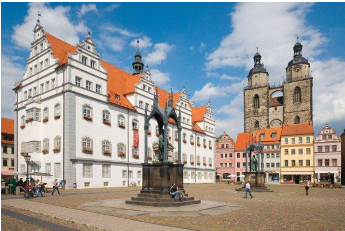
Market place in Wittenberg

After a turbulent history a number of buildings of the city still bear witness of the new spirit of that time and invite to reflect anew Christian faith and religion. Today Wittenberg has about 46,000 residents. In 2017, the city is at the center of the commemoration of the events 500 years ago that led to the Reformation.